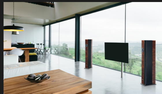
The sound you'll hear with the VC 2 will fill you with enthusiasm and inspire you with a light-hearted enjoyment of music. All details are ideally in tune with each other.

The care taken in every step of production is part of Brodmann's commitment to having a place in that history. Voice tuning is still done expertly and painstakingly by ear. Even the smallest screw is hand-drilled to specifications that ensure it does its job as part of the resonating instrument. Our speaker systems and our instruments have an essential common element: the distinctive and highly valued Brodmann sound. Dynamic. Natural. We build speakers not as mere vessels, but as instruments themselves. Beautiful in performance and appearance, they are destined to be the classics of tomorrow. We invite you to listen. If you love music as we do, the sound you'll hear from our speaker systems just might make you fall in love all over again.