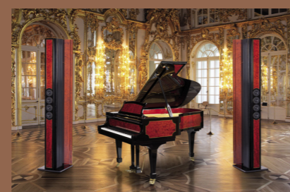
The Brodmann Senator. Handmade with the most beautiful Pommele Mahagoni wood from one tree nished with gold brass inlay along the edges, both on piano and loud-speaker. No other manufacturer in the world can offer this wonderful combination.